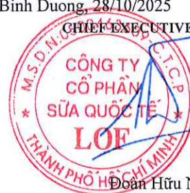
Đoàn Hữu Nguyên