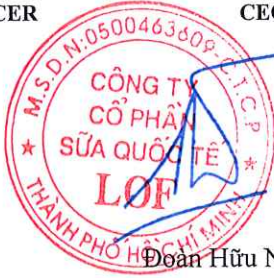
Đoàn Hữu Nguyên