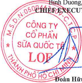
Đoàn Hữu Nguyên