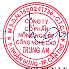
NGUYEN LE BAO TRANG