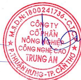
NGUYEN LE BAO TRANG