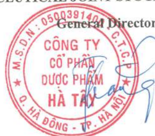
Le Xuan Thang

(Notes from page 10 to page 38 are an integral part of these Interim Separate Financial Statements)