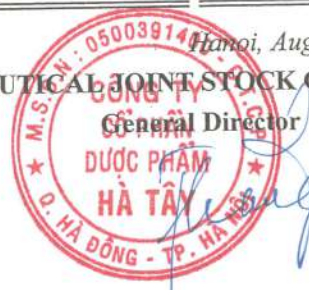
Le Xuan Thang

(Notes from page 10 to page 38 are an integral part of these Interim Separate Financial Statements)