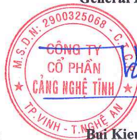
Bui Kieu Hung