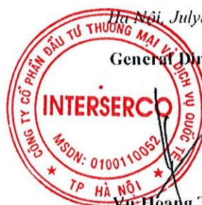
Vu Hoang Thao