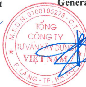
Tran Duc Toan