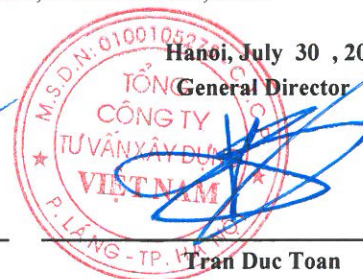
Tran Duc Toan