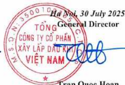
Tran Quốc Hoan