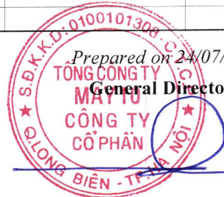
Than Duc Viet