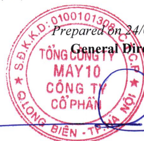
Than Duc Viet