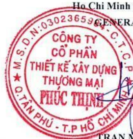
TRAN MINH TRUC