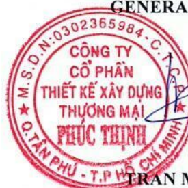
TRAN MINH TRUC