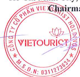
TRAN VAN TUAN