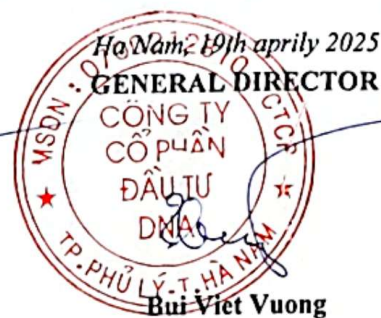
Bui Viet Vuong