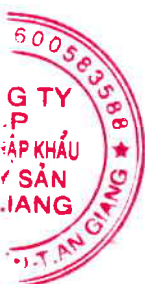
Châu Duy Cường