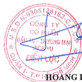
HOANG HUY HUNG