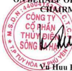
Vu Huu Phuc