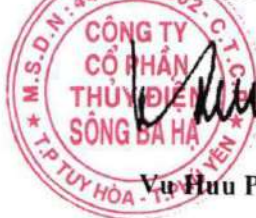
Vu Hưu Phúc