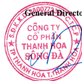
Vu Thi Ly