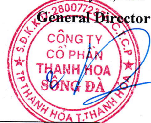
Vu Thi Ly