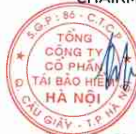
PHUNG TUAN KIEN