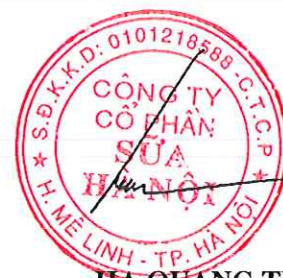
HA QUANG TUAN