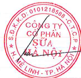
HA QUANG TUAN