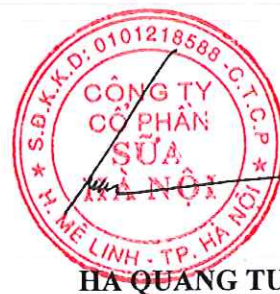
HA QUANG TUAN