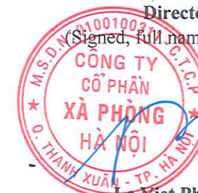
Le Viet Phuong