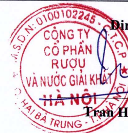
Tran Hau Cuong