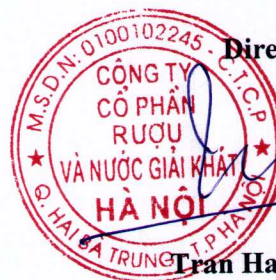
Tran Hau Cuong