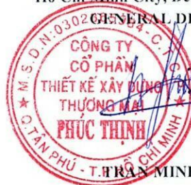
TRAN MINH TRUC